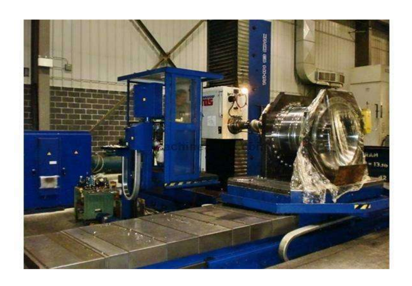
TABLE SIZE: 2200 X 1800 MM. SPINDLE DIA.: 130 MM