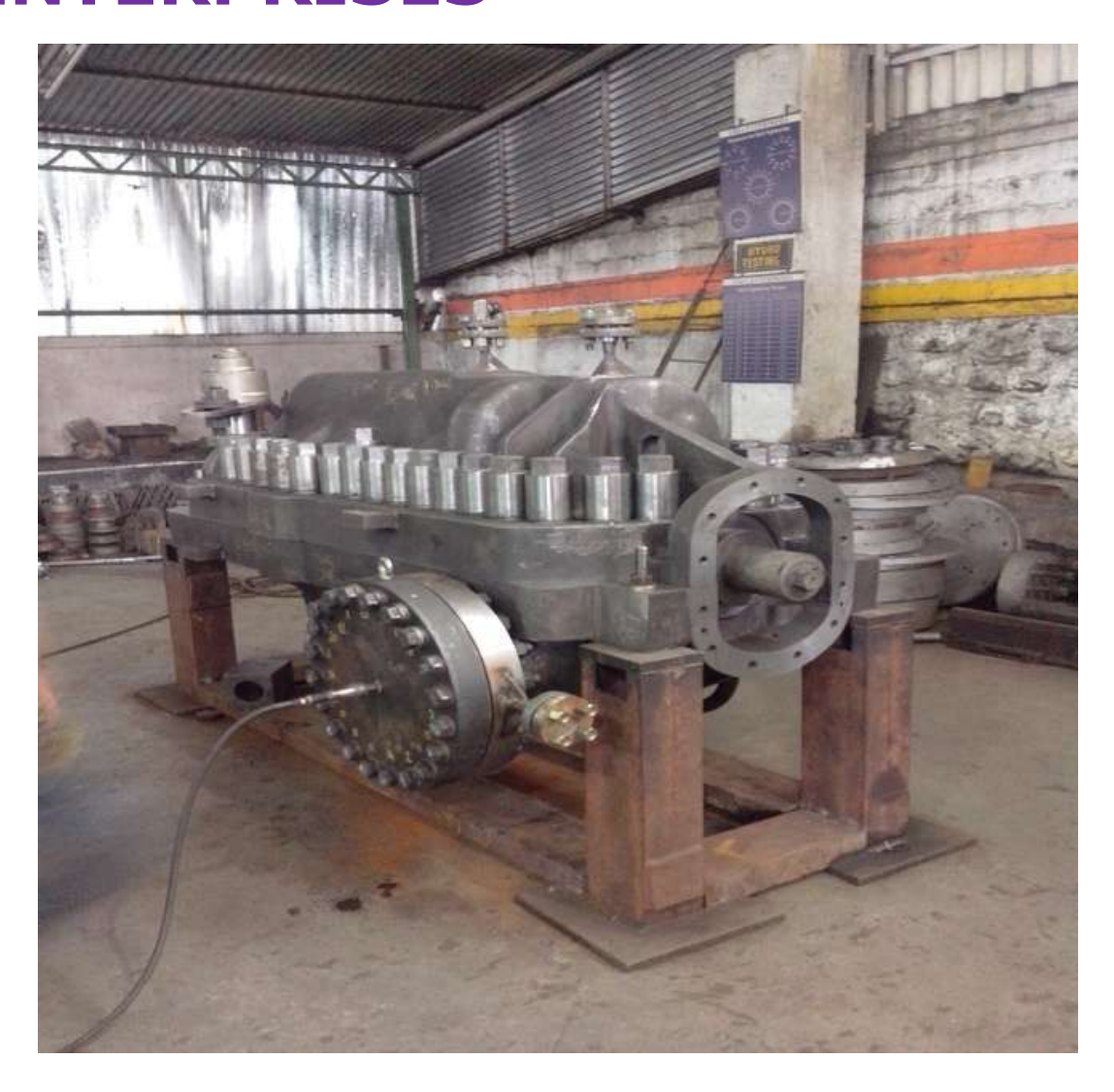
8 x 15 DMX hydro testing @ 310 bar pressure