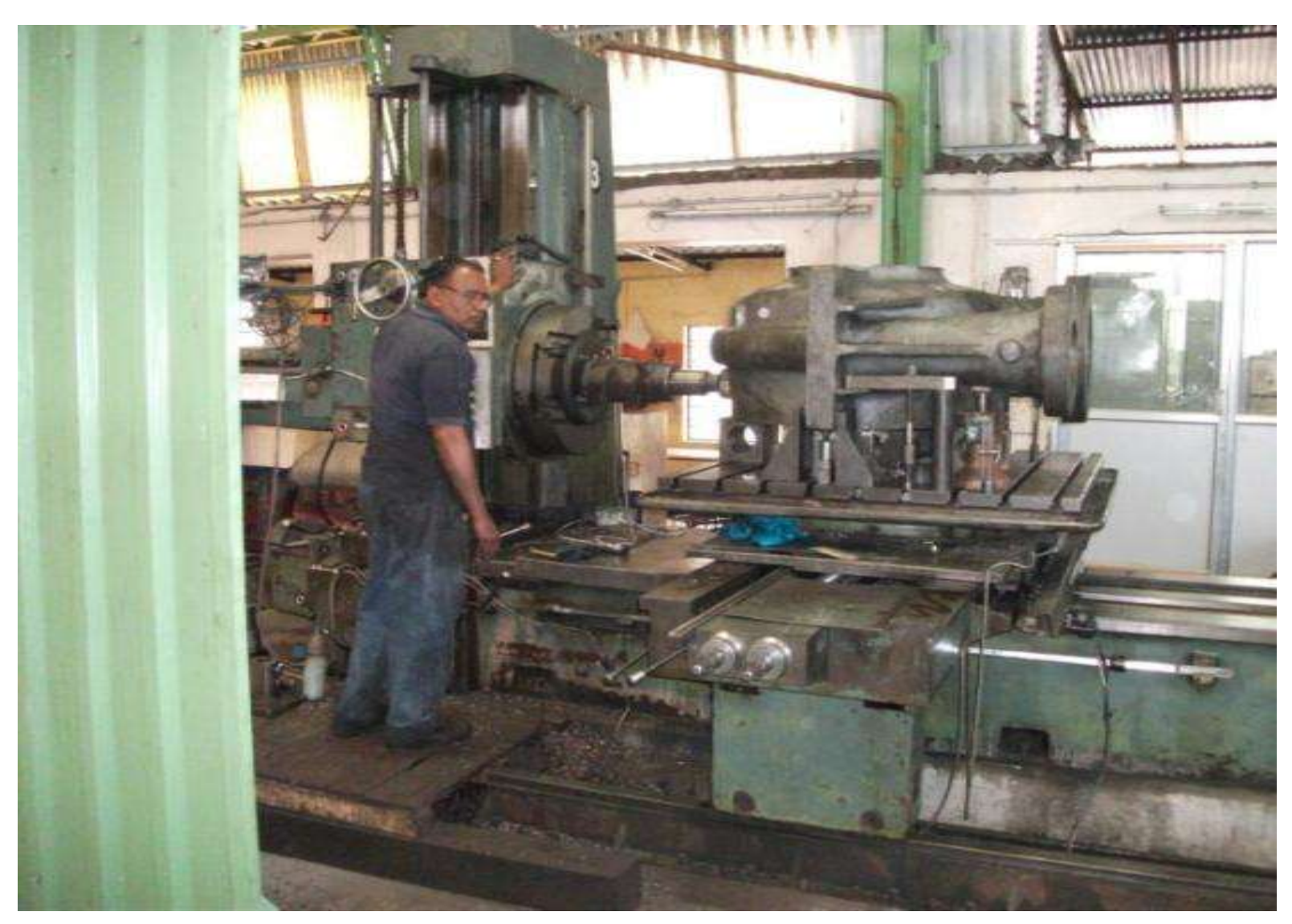
TABLE TYPE - 1500 X 1600 MM